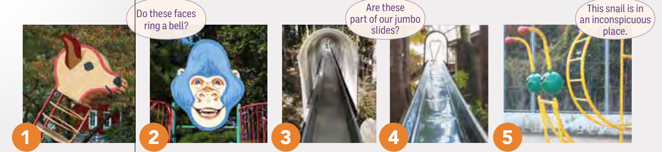
Do these faces ring a bell?

Some of our playground equipment is easily recognizable, but some equipment is difficult to recognize without seeing the whole structure. Please check them out!