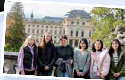
In Würzburg, Germany visiting a Bavarian palace (the three students on the right are MeySen students)