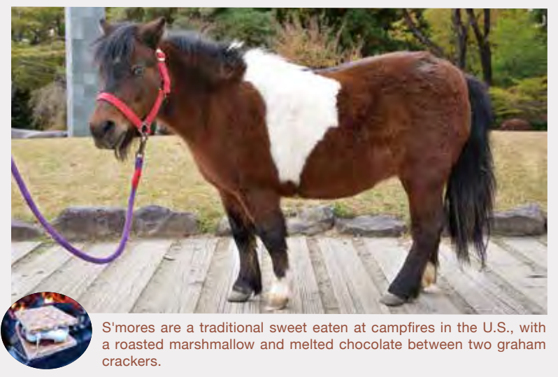
S'mores are a traditional sweet eaten at campfires in the U.S., with a roasted marshmallow and melted chocolate between two graham crackers.

We welcomed a new pony at the Maruyama campus on October 20, after Fancy passed away due to old age. Our new pony is a 3-year-old filly born in Yamagata, with an inquisitive personality; seemingly always curious about what's going on around her. She has a black right eye, a blue left eye, and a chubby belly! We hope you all get along with her.