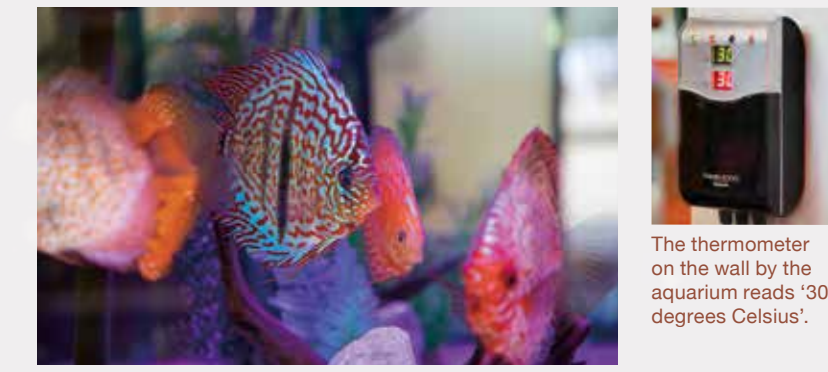
The name "discus" comes from its almost circular or disk-shaped body, when viewed from the side. There are four of them located in the Spring Building at the Maruyama campus.

The tropical discus fish (Maruyama Spring Building) Discus fish live in freshwater with high temperatures, such as the Amazon River in South America, so room temperature water in winter is too cold for them. Our animal care team add water of 30 degrees Celsius when changing the water in the aquarium, and they have an alarm that sounds if the temperature of the water heater drops. Come by and see the discus fish enjoying their spa-like atmosphere!