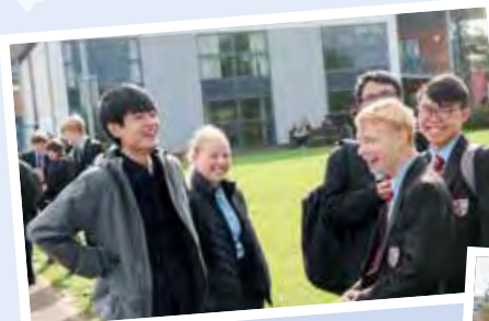
At high school in England

We hope that these experiences will enrich our students lives and give them a greater variety of options in their future school life, and that they will search for places where they can shine both at home and abroad.