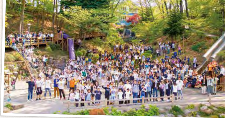
▲ About 500 people gathered for the reunion held last year after a three-year absence, due to the COVID pandemic.

In 1998, MeySen established an alumni association for its Friends Club graduates and holds alumni reunions annually, in May. In addition to the reunions, many alumni also volunteer their time to help support some of our school's main events, throughout the year. More recently, graduates of the Premier Elementary School have begun joining our Alumni Association, and now many alumni from both programs participate in its activities, using the opportunity to stay connected with their former classmates and teachers, even long after graduation.