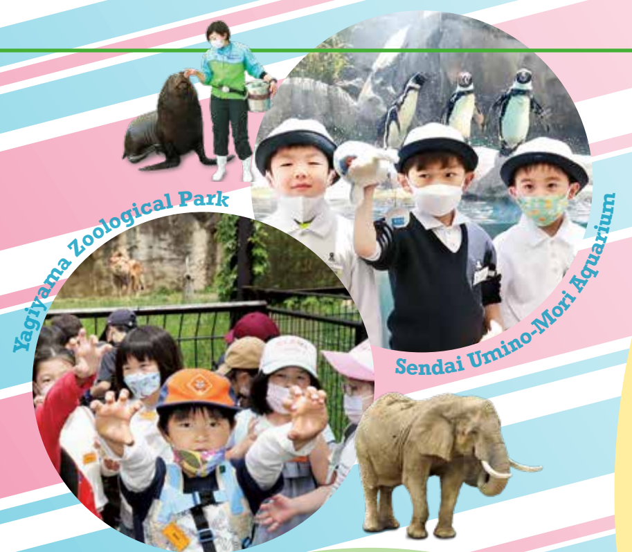
Yagiyama Zoological Park