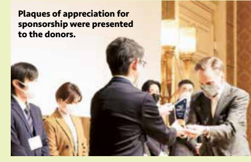
Plaques of appreciation for sponsorship were presented to the donors.

In January, we held a gathering to show our appreciation for the donations made by local businesses, that were used to support our community-integrated study abroad support project "A Way We Learn" and also supported the construction of our new Toddler House building. The number of businesses that support "A Way We Learn" has increased from 25 in 2017 when the program began, and is now up to 93, and we cannot thank them enough for their generosity.