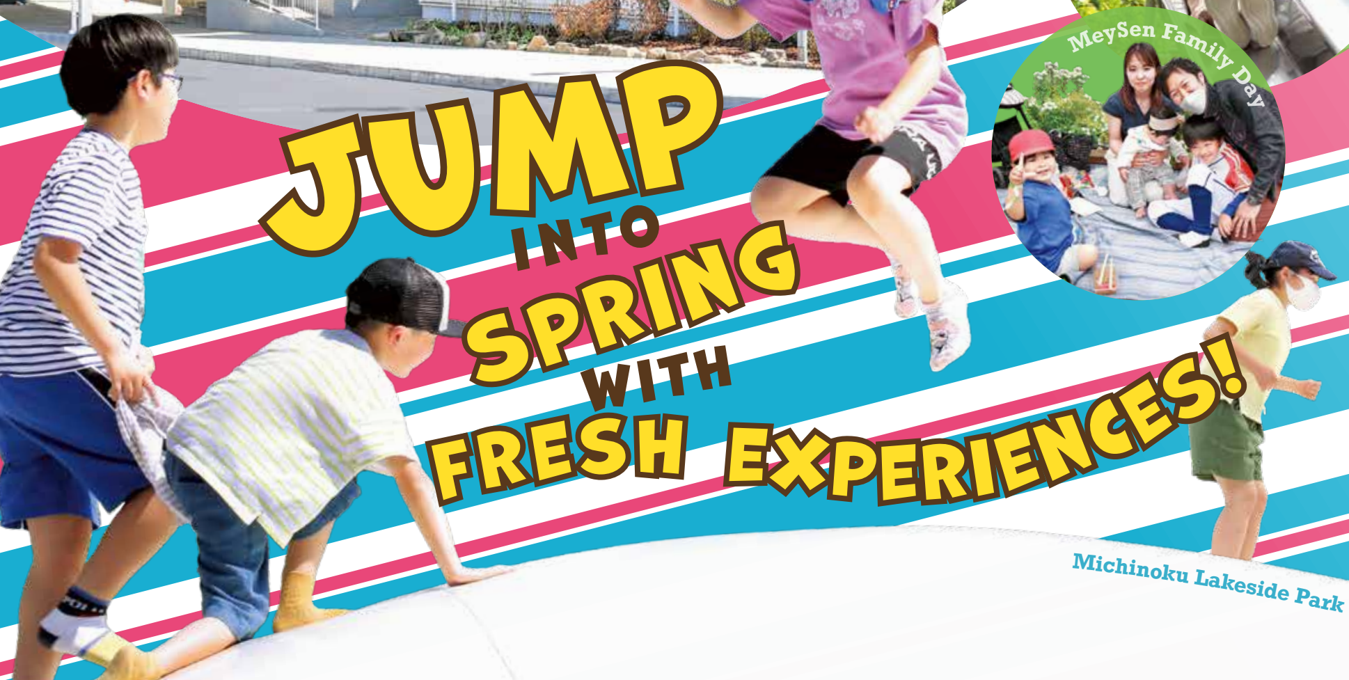
Michinoku Lakeside Park

JUMP INTO SPRING WITH FRESH EXPERIENCES!