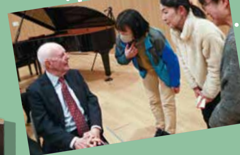
We would like to express our warmest wishes to the teachers who are leaving MeySen, as well as to those who will continue to work with us in the new school year.