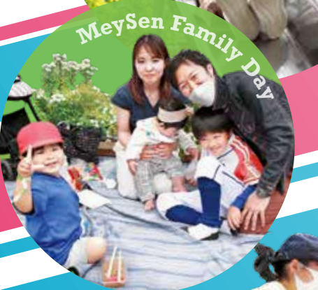
MeySen Family Day