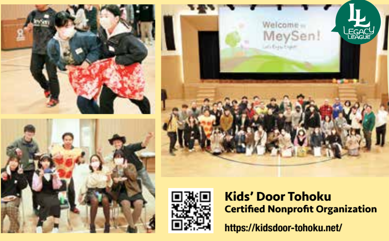
Kids' Door Tohoku Certified Nonprofit Organization https://kidsdoor-tohoku.net/